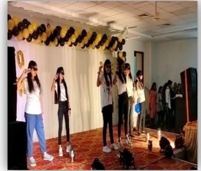
Dance Performance By students