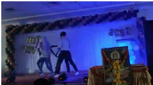
Dance Performance By students