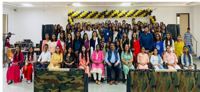
Group photo with fresher's