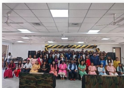
Awarded winners of essay competition