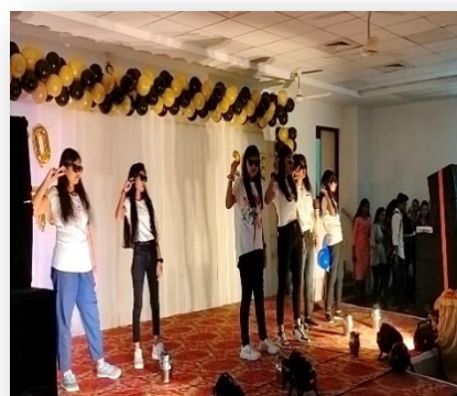
Dance Performance By students